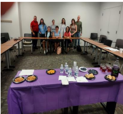
Thanks Roanoke support group