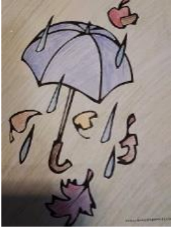
Thanks for the paint night pictures